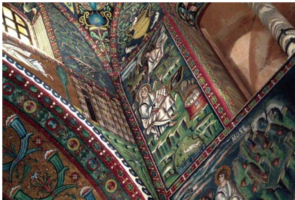
Right: Mosaic tile installation at San Vitale in Ravenna, Italy, dating back to 522 A.D.

Multiple studies have been run with such tiles installed in heavy commercial applications over many years, often with very little evidence of wear after many years of heavy foot traffic, although some of the darker tiles scored as low as class 2 in the C1027 test.